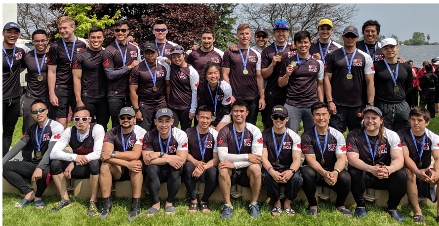
(NDRC Premier Open): NDRC Orcas at the Pickering Dragon Boat Festival.

Through these efforts, NDRC became world champions in the premier mixed 500m in its first international appearance and were also the only Canadian men's crew to reach the podium.