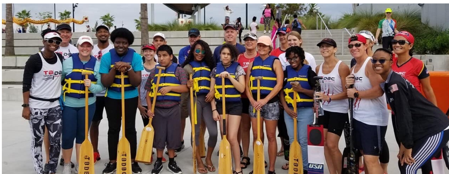
NLHP paddlers (sporting full PFDs) take break from paddling prep at Tampa's River Center for a quick group photo with TBDBC volunteers.