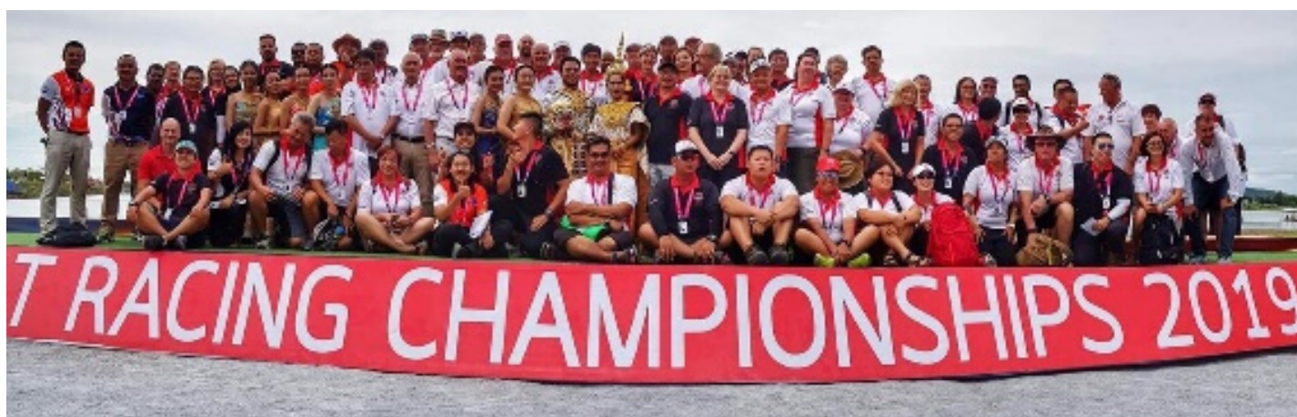
IDBF race officials at the 14th IDBF World Dragon Boat Championships, Pattaya Thailand.