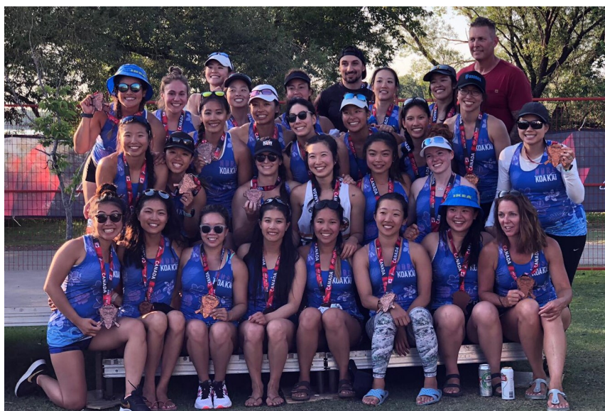
(NDRC Premier Women): NDRC Koa Kai at the Canadian National Championships.